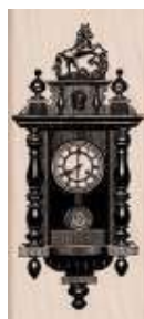
Regal Time Piece