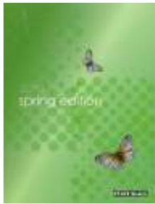
All Spring 2010