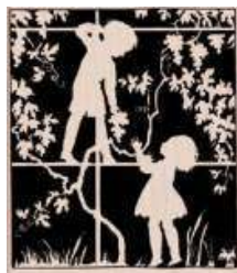
In The Garden