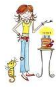
Join The Party