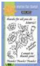
A Million Thanks