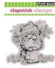
You Are The Best