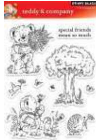
Teddy & Company