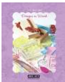
All Designs in Wood